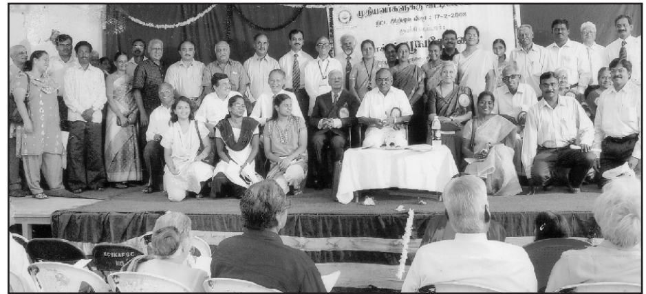
Launch of Geriatric House Call Project on February 17, 2008