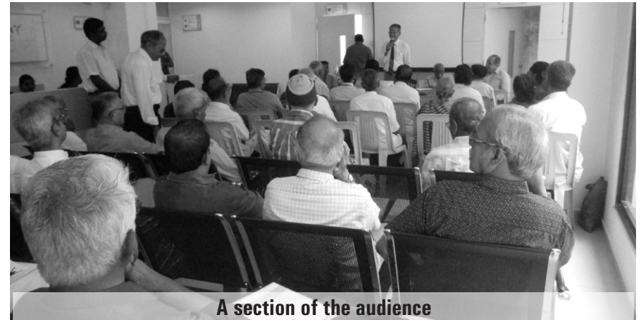
A section of the audience

He highlighted the state of art & expertise available. The Latest